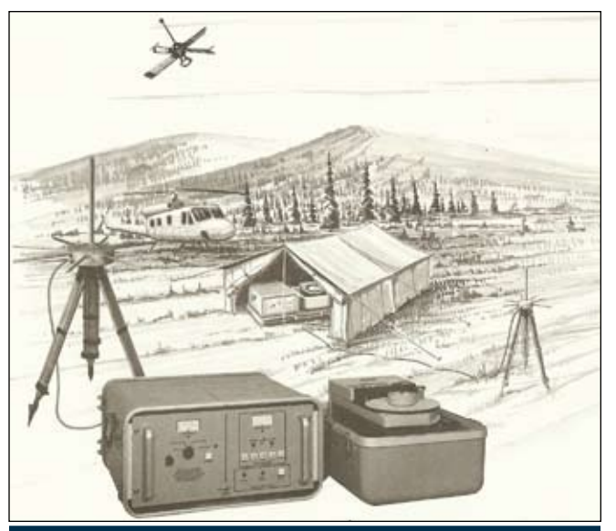
FIGURE 2 An advertisement for a commercial Transit system, the CMA-772B NNS.

engineering applications. These included surveying and mapping, positioning in offshore engineering, the monitoring of local crustal dynamics and plate tectonics, the relative vertical movements of tide gauges, and the continuous 3-D movements of critical engineering structures, such as tall buildings, dams, reservoirs, and long suspension bridges. All of these applications required very high relative positioning accuracies, but not quasi-instantaneously as in the safetycritical navigation and landing of civilian aircraft. This came much later.