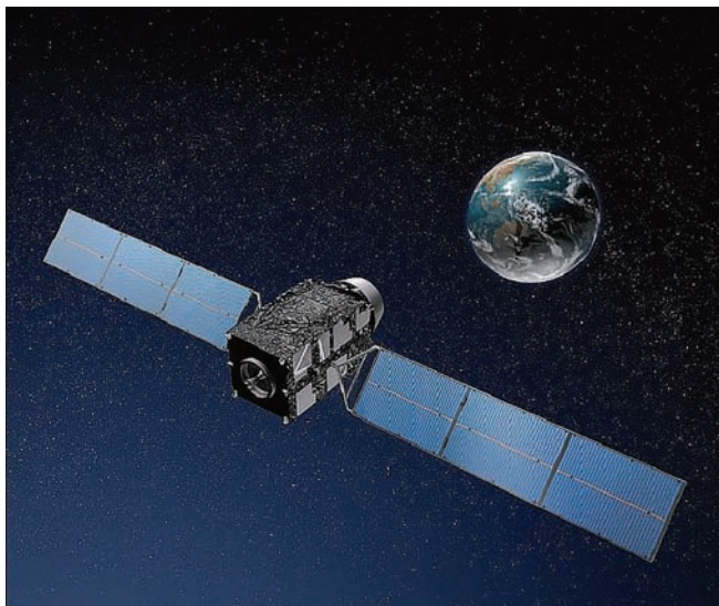
QZSS satellite "Michibiki" Japan Aerospace Exploration Agency graphics

again with the nature of declaring a policy program.